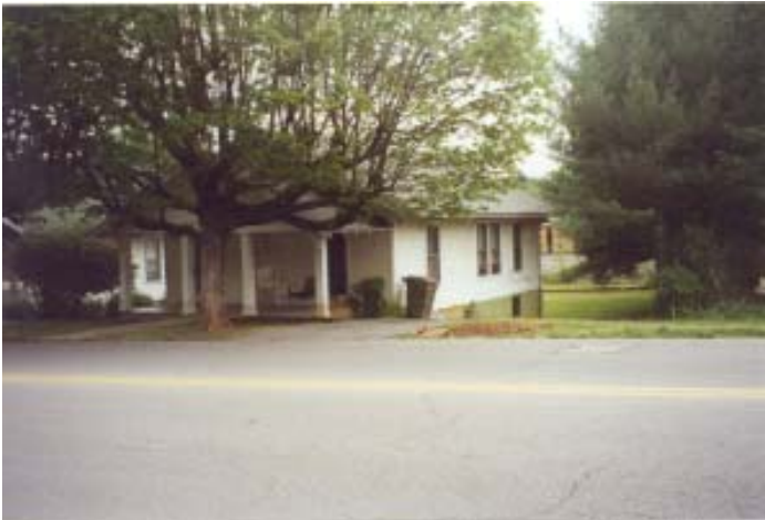
1140 East Main Street