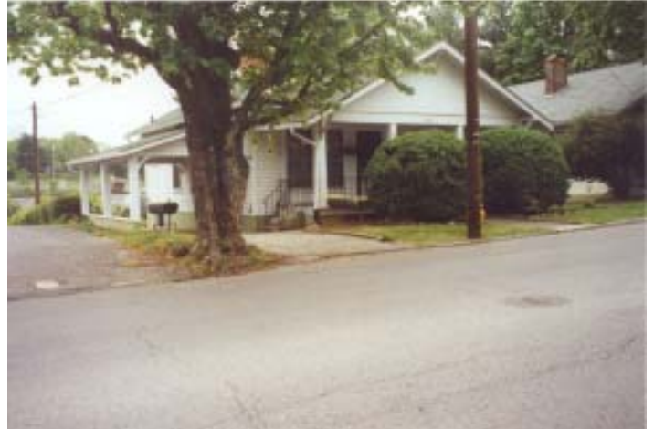
1144 East Main Street

DIRECTIONS: From Highway 11-E By-Pass, turn South on King Avenue at Rusty Wallace Cadillac, Pontiac & GMC, right on Main Street and property on the left.